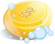
Soap- Clean your body off

Talk about the objects used to take a bath. Ask your child to tell you what it is and what to do with it.