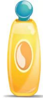
Shampoo- I wash my hair with