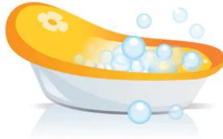
Bathtub- where I take my bath